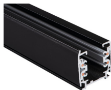
33232 TEAR N TR 2M-W